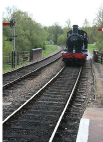
Changing Ends at Half-Time!