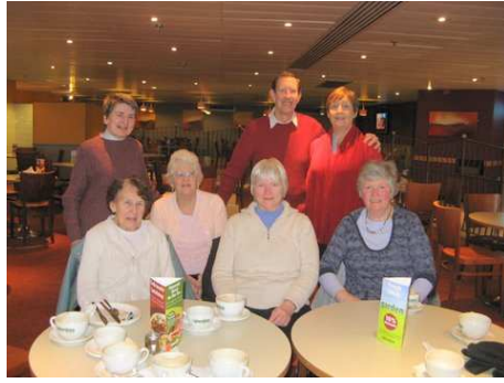
The group at the first Alders coffee morning. Since then numbers have increased significantly!

Our members are still hungry and thirsty! As well as the monthly coffee mornings (now at Alders), we have twice been to our old haunt of Knight's and the annual visit to Chartwell is in July. In addition please take a note of the new venue on Polhill.