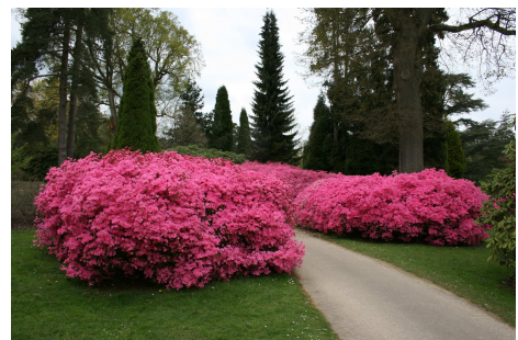
Sheffield Park Gardens, where several of us went afterwards