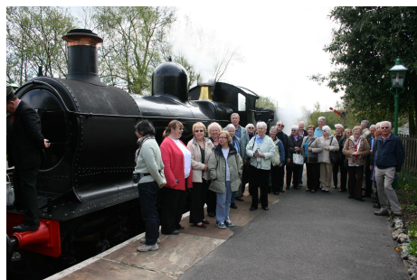
The Party Beside 'Earl of Berkeley' at Kingscote Station